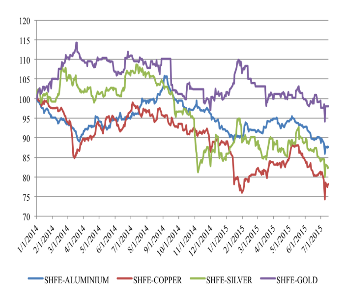
Graph 4: SHFE commodity price indexes (Jan 2014- Jul 15, Base date: 01/01/14)

The size of the copper futures contract is for example 5 tons on the SHFE but five times more at the London Metal Exchange, the historical world marketplace for base metals. Similarly, the silver futures contract is 15 kilograms in Shanghai and 5,000 troy ounce in Chicago, i.e. around 150 kilograms. This doesn't necessarily mean that the Chinese futures markets are more speculative than others, but they seem more retail-oriented and as a consequence do have the potential to become so. This is even truer for metals that are historically viewed in China as an interesting investment support.