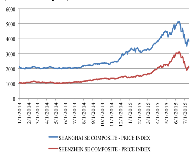
Graph 1: Chinese stock index dynamics (Jan 2014- July 15)

promises of high profit to jump into the stock market with the blessing of the government: the wild ride up has indeed been a financial bonanza for the economy, allowing for example state-owned enterprises (SOE) to sell highly valuated shares to repay their debt.