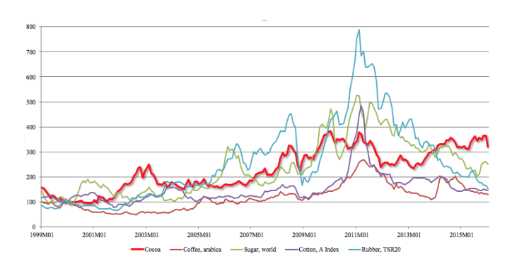
Graph 1: Soft commodities price dynamics (Indices, base 100: jan. 2000)

Among commodities, cocoa occupies a special place, probably because this base product for chocolate is associated, in the collective psyche, with times of enjoyment. There are, however, several other reasons to distinguish it from other commodities. Firstly, in contrast to wheat for example, cocoa beans, i.e seeds from the cocoa pod, are a "low-volume/high price" commodity. In 2013, world wheat production hovered around 711 million metric tonnes, against 4.5 million for cocoa. Cocoa is a fragile, shade and humidity loving tree which only grows within the 20° latitudes. Secondly, as shown by graph 1, in a severely depressed economic environment which has hit almost all commodity markets, cocoa stands out as an exception: average world prices<sup>2</sup> jumped from 2.63USD per kg in January 2011, to 3.35USD/kg in December 2015, which represents an increase of more than 27%, whereas cotton prices plummeted by more than 59% during the same period. The fear that cocoa beans may be in structural short supply, combined with several climatic phenomena such as El Nino and the "Harmattan" cold wind which could