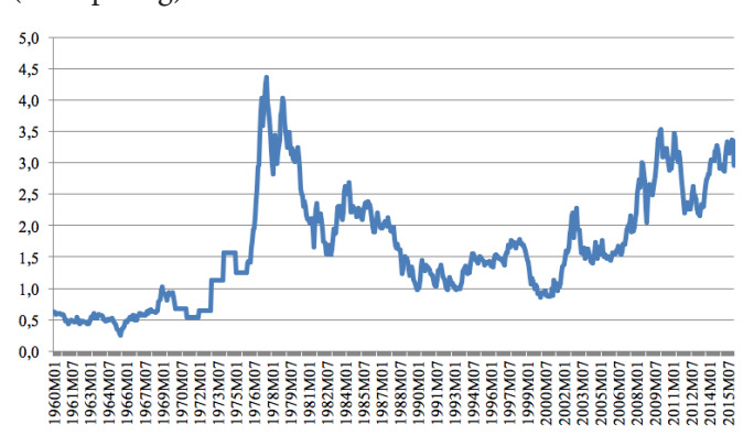
Graph 3: Long term nominal cocoa prices (USD per kg)

months. In 1938, the Nowell commission, named after its chairman, was consequently set up to investigate whether the marketing conditions of cocoa were appropriate. Two years later, the West African Produce Control board was established as a monopoly purchasing agency for groundnuts, oilseeds and cocoa, under the supervision of the Ministry of Food. One of its roles was to fix minimum seasonal buying prices (Blandford, 1977), but also to act as a taxation body for the government. This would give rise to two marketing boards in Nigeria and Ghana in the aftermath of WWII.