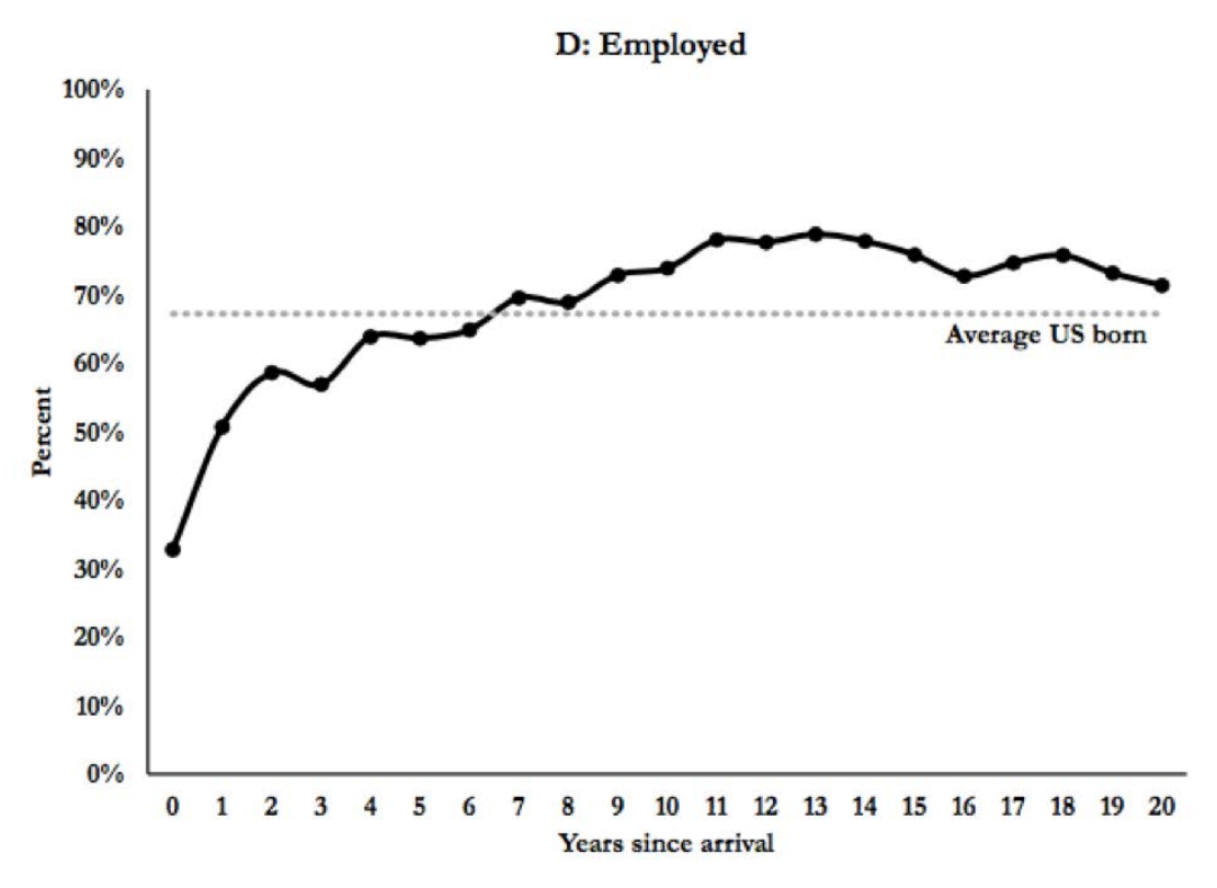
Chart 5: Outcomes of Refugees that Entered the U.S. at Ages 18-45 as a Function of Years in the U.S., Compared to U.S. Born Adults, 18-65

Refugees who entered as adults (18-45) had lower educational attainment than U.S. born adults at the time of the survey in 2010-2014: 67% have a high school degree and 23% have a college degree, compared with 91% and 37% among natives; and their labor earnings are $23,000 compared with $35,000 for natives. Refugees have much lower English language skills. Moreover, 9.3% are on welfare and 39% are on SNAP (food stamps) compared to 3% and 4.8% of natives. However, 68% of refugees are employed, a slightly higher rate than natives, 67%. Controlling for age, gender and education, refugees attain higher labor participation and employment rates than the U.S. born after about ten years in the country.