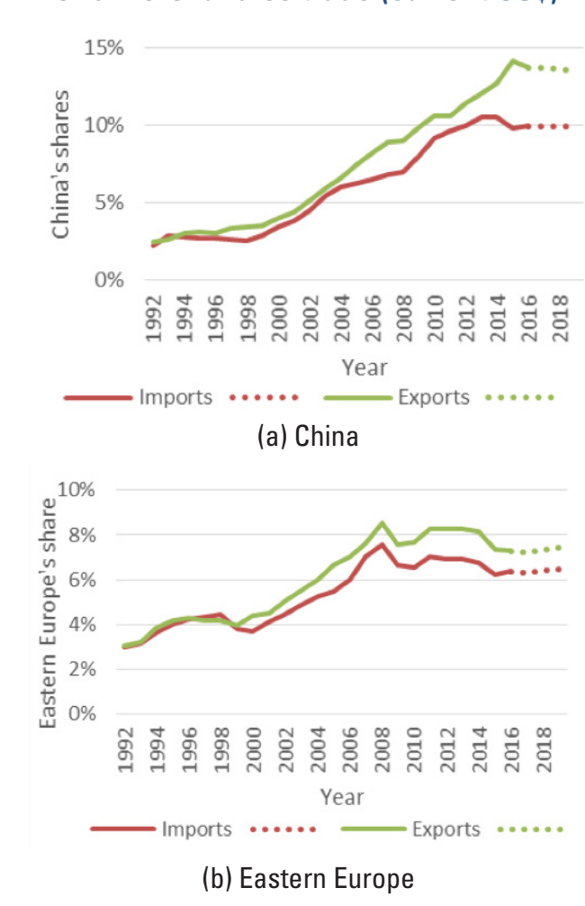
Figure 1: China and Eastern Europe<sup>5</sup> merchandise export and import shares of world merchandise trade (current US$)